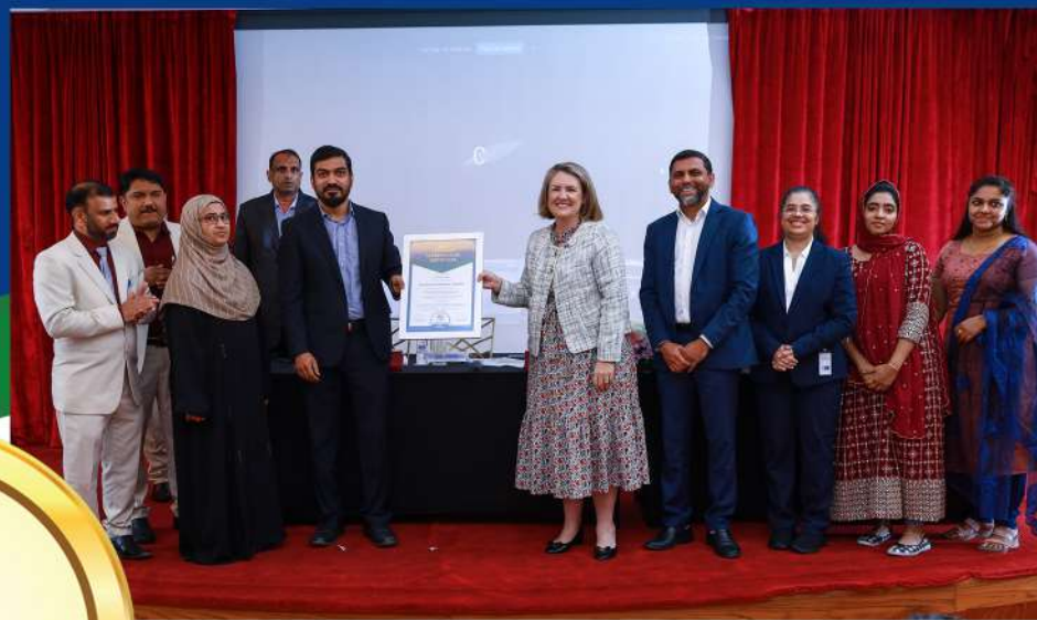
CITY CLINIC INTERNATIONAL