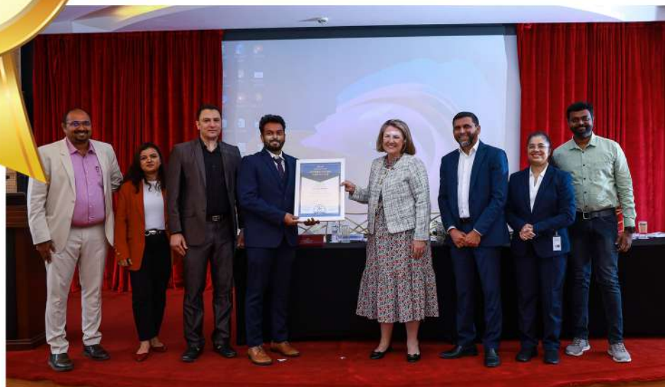
CITY CLINIC KHAITAN