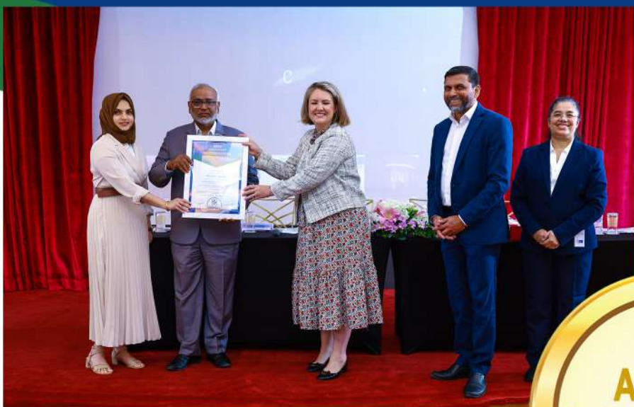
CITY CLINIC MIRQAB