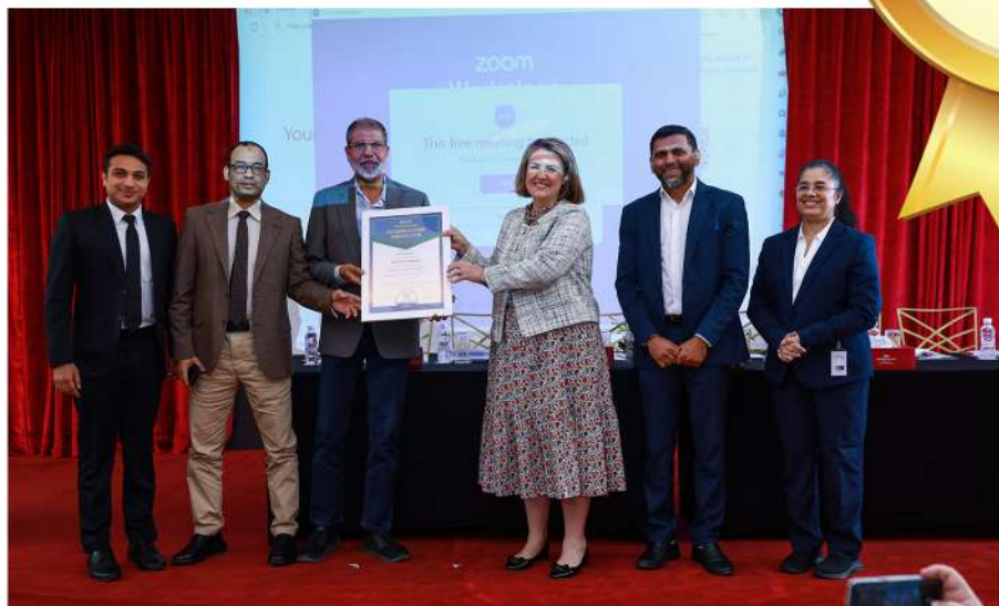
CITY CLINIC MAHBOULA